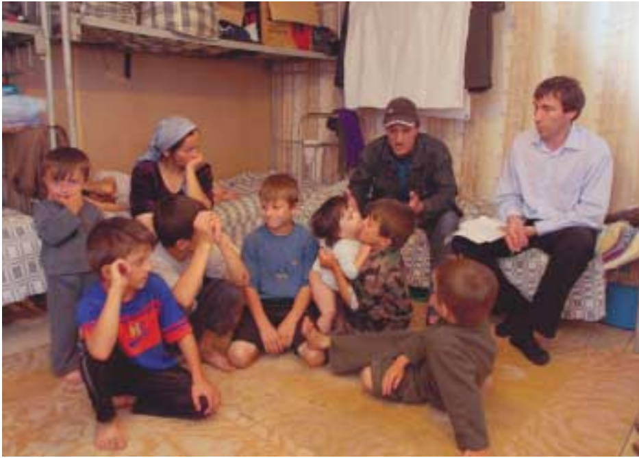
Chechen internally displaced family in one of the temporary settlements in Ingushetia

of the Danish Refugee Council, UNHCR partner. Therefore part of the humanitarian assistance will be directed to assist these IDPs while they remain there as well as to assist those wishing to remain permanently in Ingushetia.