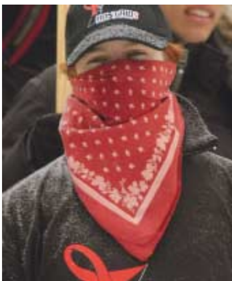
1 December 2004. Authorized demonstration in front of the White House, Moscow, by people living with HIV/AIDS. Commitment of the top officials is vital to stop the spread of AIDS epidemic

The concept of the three principles was discussed for the first time at the International Conference on AIDS and STIs in Africa (ICASA) held in Nairobi, Kenya, in September 2003, where officials from national coordinating bodies and relevant ministries, major funding mechanisms, multilateral and bilateral agencies, NGOs and the private sector gathered for a consultation to review principles for national-level coordination of the HIV/AIDS response.