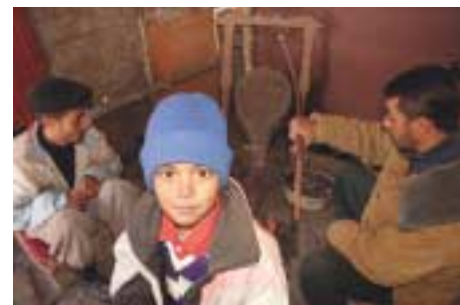
Blacksmith's house at the Komsomolskoe settlement in North Ossetia is one of the UNHCR quick impact projects carried out for refugees from Georgia

During the closure of the tented camps IDPs were offered an alternative shelter to move in case they chose not to return to Chechnya. After closure the camps approximately 23% of IDPs indeed opted to relocate to alternative shelters in Ingushetia, and UNHCR and its partners were heavily engaged in ensuring that IDPs were made aware of options without undue pressure. At the end of December 2004, 35,170 Chechen IDPs were still registered in Ingushetia for assistance in the database