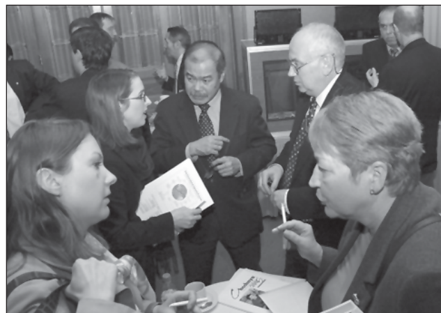
A lively dialogue between the Consolidated Appeal presentation participants

The meeting was attended by representatives of the Russian Government, UN Agencies, donors and NGOs who after the official CAP 2005 presentation engaged in a productive dialogue.