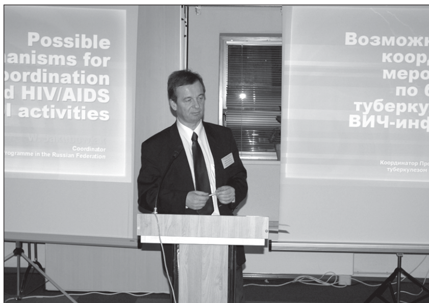
National TB/HIV Workshop was organized on 14-15 December 2004 in Moscow

Meeting of the High Level Working Group on TB in the Russian Federation (HLWG) was held on 16 December 2004 in Moscow. Members of the High level working group on TB in the Russian Federation, Russian and international partners met