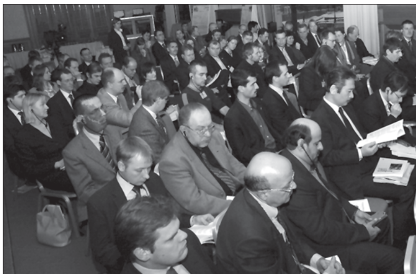
The meeting is attended by representatives of the Russian Government, UN Agencies, donors and NGOs

The United Nations Humanitarian Coordinator, supported by the Office for the Coordination of Humanitarian Affairs (OCHA), facilitates overall coordination of humanitarian agencies in Chechnya and neighbouring republics of the Russian Federation. Further information on the humanitarian activity in the region is available at the OCHA Office in Moscow and Nazran or on OCHA web-site: www.ocha.ru