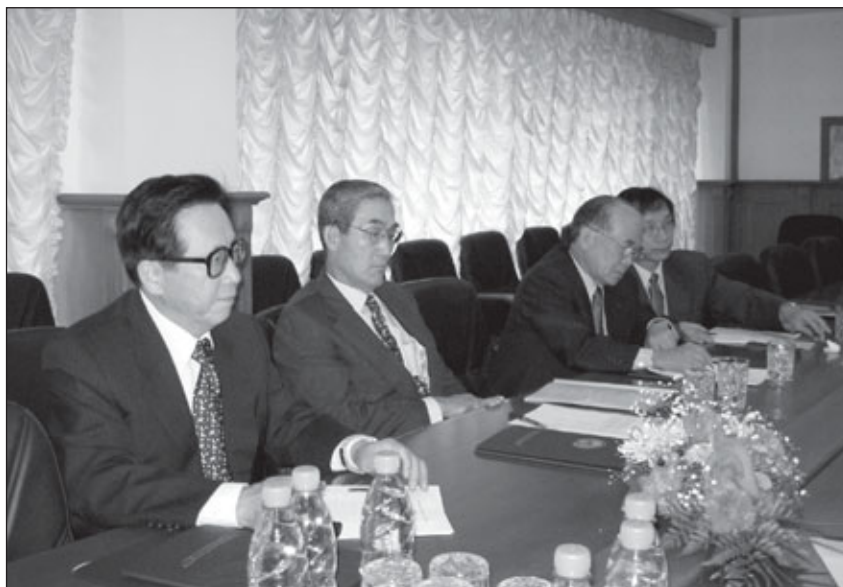
The guests: the delegation of the UN Association of the Republic of Korea...