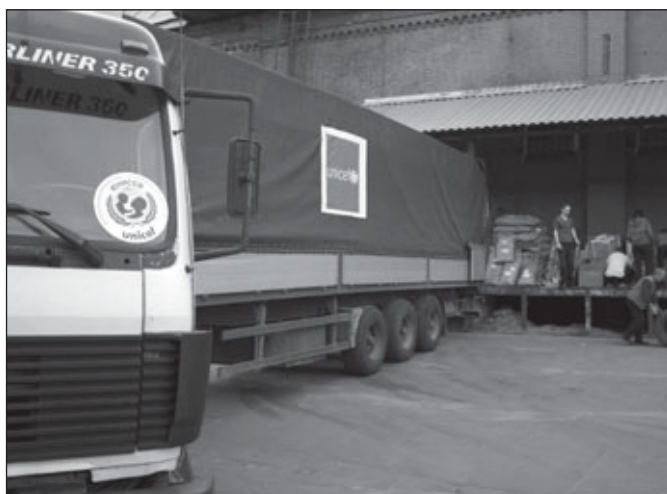
UNICEF delivered 20 tons of medical supplies to hospitals in Beslan and Vladikavkaz to treat the injured children

Deliveries of assistance are planned as needed. The UN remains in contact with the Government which has not officially requested international assistance but accepts humanitarian aid voluntarily provided by foreign countries and international organisations.