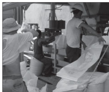
The Russian wheat has been delivered to DPRK to feed WFP's 6 million beneficiaries

In June and July, more than two million of the agency's "core" beneficiaries, including large numbers of kindergarten and primary school-children and pregnant and nursing