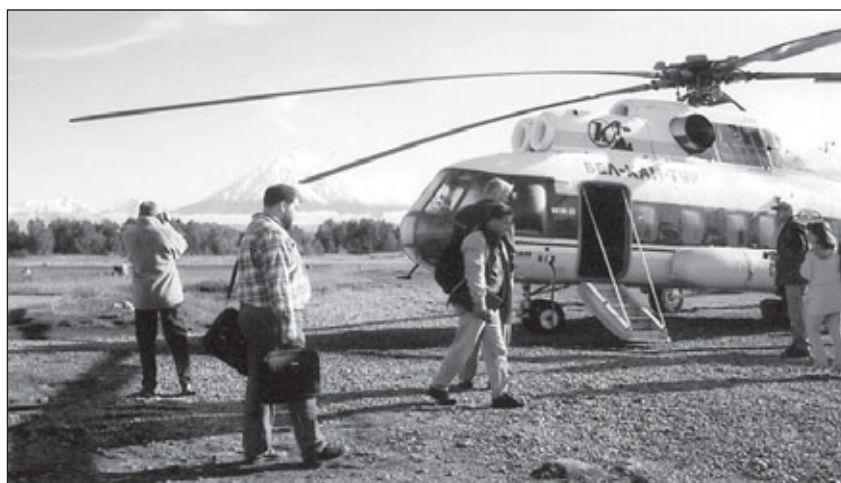
UNDP Environment Unit staff members work in Kamchatka

are being implemented. Beforehand we are thinking how to ensure that the portfolio is not exhausted over a few years. There is a wide geographical scope of the current projects, covering remote areas from Kamchatka to Murmansk and from Taimyr to Astrakhan. Almost all the project sites are far from the centre, in the remote regions which have the least development status. This reflects the overall UNDP policy which is to prioritize its areas of support in order to render assistance for the least developed areas that depend on federal subsidies and funding rather than self-sustenance. The combined budget of the environment-portfolio is approximately 20 million US dollars. The largest single project in terms of budget is the one relating to Protected Areas in Kamchatka: its budget amounts to more than 6 million dollars. At the same time 20 million dollars is not much considering the number of projects. We are trying to raise the effectiveness, or output of our financial contributions, i.e. not only provide financial allocations for grants (millions is not nearly enough for grants), but to make these available funds “work”, create mechanisms for self-repayment of project expenses, like micro credits in the Kamchatka case. This type of approach is intended to develop a sense of ownership amongst the stakeholders in the project so that with vested interests, the outputs are sustained long after the project has been completed.