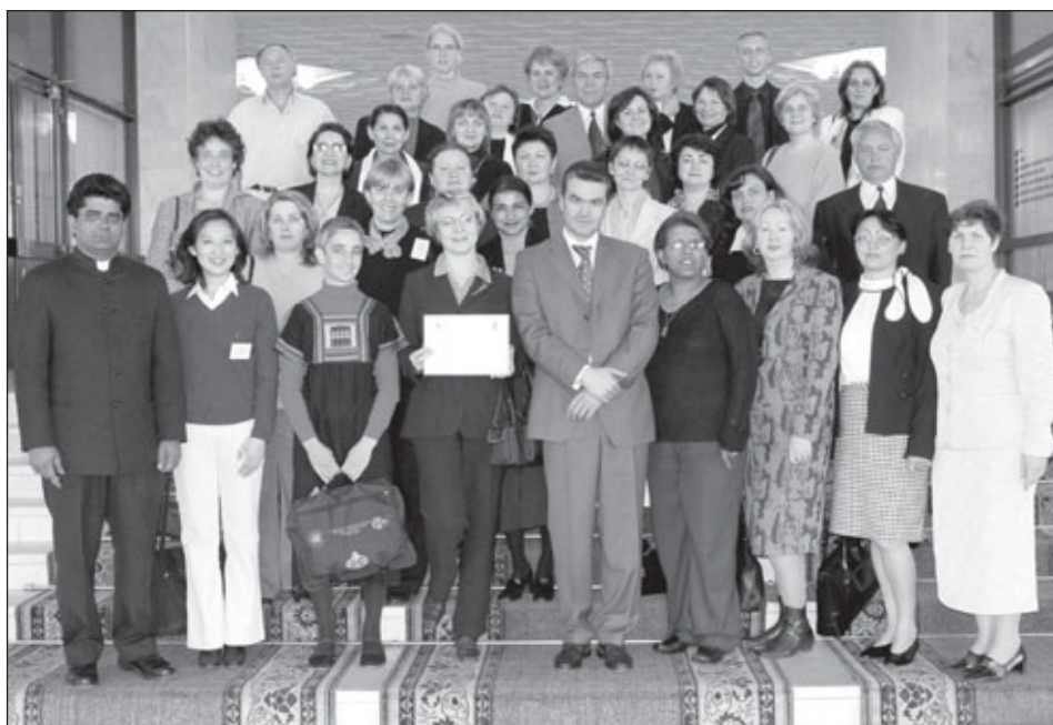
The participants of the International Workshop on Gender-Sensitive Budgeting

The workshop in Moscow was organised thanks to the support of the UNDP "Gender Responsive Budgets: Investing in Poor Women to Reach the Millennium Development Goals" global project, which is funded by the Japanese Women in Development Fund and administered by UNDP.