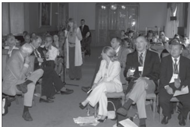
The first in Russia seminar "Building Media Awareness on Tuberculosis" brought together more than 30 Russian and international press delegates

Tuberculosis (TB) disrupts the social fabric of society through stigma and ignorance that are TB's most powerful allies. Public awareness on the disease is still very low in Russia and the mass media are vital in driving the TB agenda.