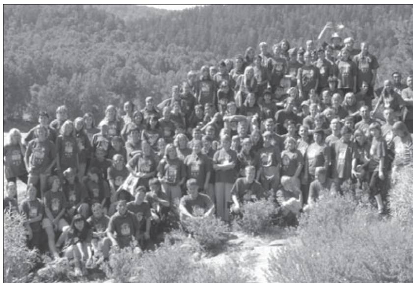
This year the summer volunteer school brought together 118 youngsters from 22 of Russia's regions to Gorny Altai

Preventing HIV/AIDS and introducing a healthy lifestyle among young people is one of UNICEF's top priorities in the Russian Federation, and corresponds to the Millennium Development Goals.