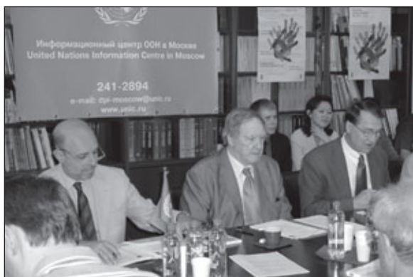
Presentation of the Global Human Development Report-2004 at the UN Information Centre in Moscow