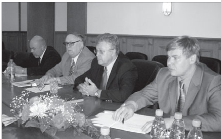
...and the hosts: the representatives of the UN Association of Russia and Moscow State Institute of International Relations

The visit of the Korean delegation to the Russian Federation produced an unforgettable impression on the guests and was an important step in consolidating the ties between the UN Associations of two countries.