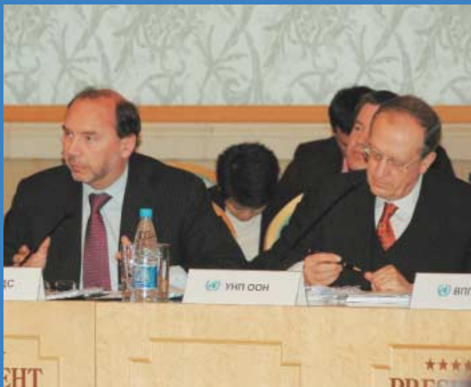
Left to right: Dr Peter Piot and Mr Antonio Maria Costa

Declaration and the WHO/UNODC/UNAIDS position paper on Substitution Maintenance Therapy. The CCO reconfirmed its strong conviction that civil society organizations must play a central role at all levels, especially at the country level, in decision-making when designing, implementing and evaluating the response to HIV and AIDS. The CCO pointed to the fact that NGOs, including people living with HIV and AIDS, are members of the UNAIDS Programme Coordinating Board, and in that capacity participate fully in the governance and decision-making of UNAIDS.