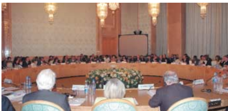
Ministerial meeting “Urgent response to the HIV/AIDS epidemics in the Commonwealth of Independent States”, President Hotel, Moscow