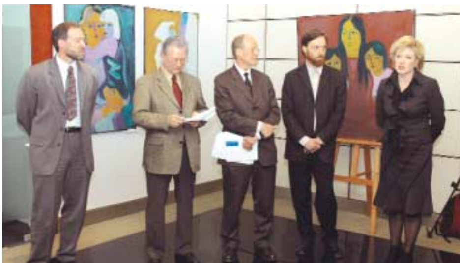
Opening of Art exhibition dedicated to the World Health day

In 2001 the officially reported maternal death rate in the Central Asian republics was 42 per 100 000 life births,