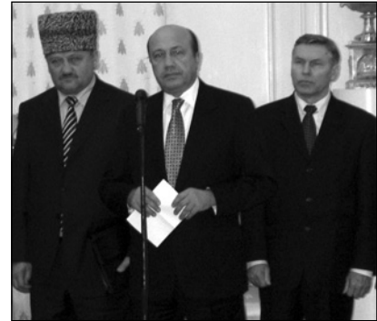
The participants of the presentation (left to right): Akhmad Kadyrov, Igor Ivanov, Vladimir Filippov

Speaking at the presentation, President of the Chechen Republic Akhmad Kadyrov expressed profound gratitude to President of Russia and to the leaders of UNESCO, as well as to the Russian Ministries and Departments for their contribution in assisting the rehabilitation of Chechnya's education system and providing its young generation with opportunities to get a quality education and be