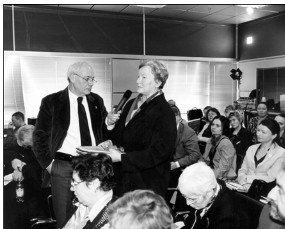
Vladimir Pozner moderates the panel discussion at the Russian Information Agency "Novosti"