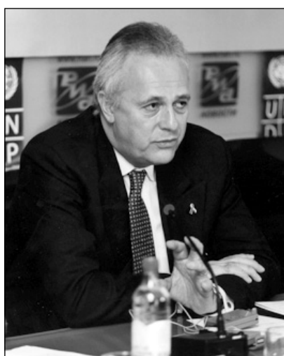
Mr Mark Malloch Brown

From February 15 th through 18, UN Under-Secretary General and UNDP Administrator Mark Mal-