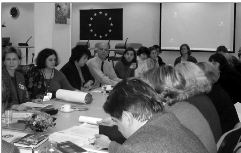
The participants of the fiftieth Interagency Meeting on Health Sector Coordination in Russia

One of the important goals of this Interagency coordination activity has been to reduce duplication of effort and ultimately to improve the results and effectiveness of international donor health projects in Russia. Another outcome has been the development of a comprehensive list of current donor funded health projects in Russia and the development of an electronic roster of such projects, past and present. The latter activity which is now known as the "Zdravinform" library is developed and maintained by the Central Scientific Research Institute for Organization and Informatization of the Health Care. It was initiated with TACIS funding and is now being supported with assistance from the WHO/CIDA HCPSR Programme. Over 85 projects have been entered into the data base and the information is available at website: http://zdravinform.ru