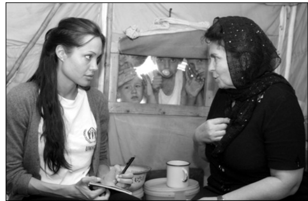
During her trip to Russia Angelina Jolie (left) dialogues an IDP woman from Chechnya

"At the end of the day, what should that matter, we are equal. They are families like us. And they need our help, our support. And in areas like Chechnya, they need us