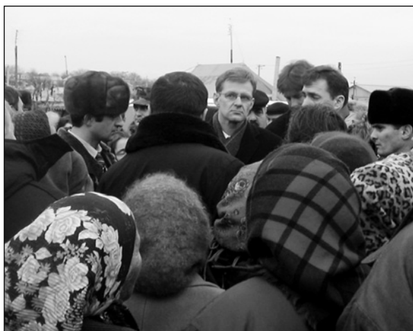
The United Nations Under-Secretary-General for Humanitarian Affairs Mr Jan Egeland in a tent camp in Ingushetia

Mr. Egeland also discussed with the Russian government the response to the consequences of the Chernobyl disaster. He suggested that a new policy forum be established for discussing cooperation between Russian and the UN counterparts related to Chernobyl, and Russian officials expressed support of the UN's intention to shift from relief to development in working with Chernobyl-affected population. From Moscow, the UN Under-Secretary-General left for Ukraine and Belarus, countries that also suffer the effects of the Chernobyl disaster, to continue discussions of the issue.